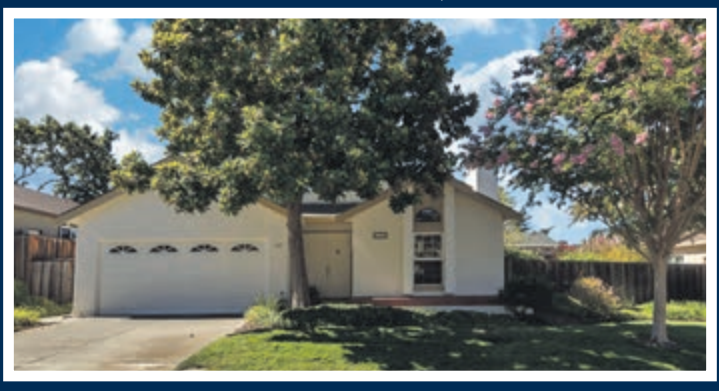
SOLD! 11 Moraga Via, Orinda Offered at $1,195,000